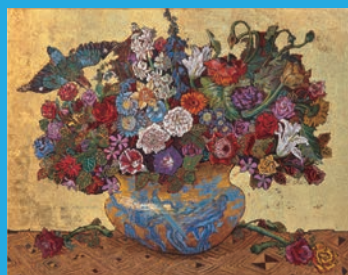
Life, Flowers in a Chinese Pottery (2002) Koji Kinutani