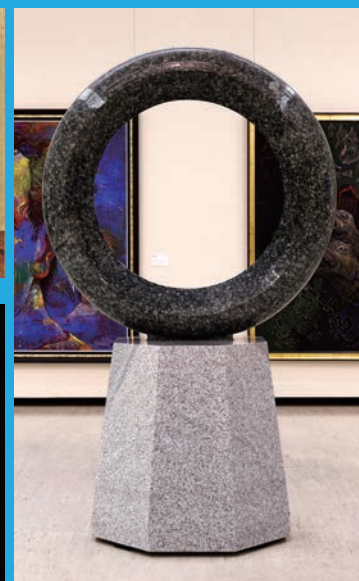
Circular Structure_001a (2025) Kota Kinutani