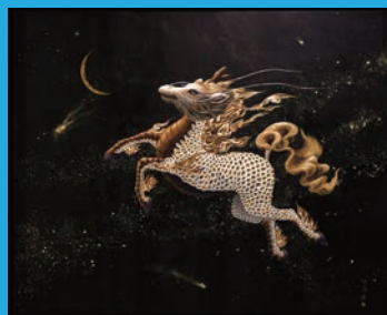
Kinn Soaring in the Moonlight Night (2024) Kanako Kinutani