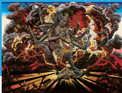
Rebuking (2015) Koji Kinutani